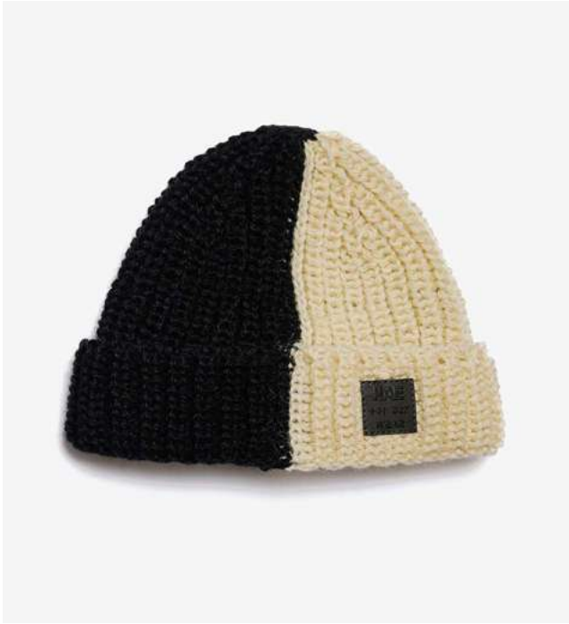
Black and Nature